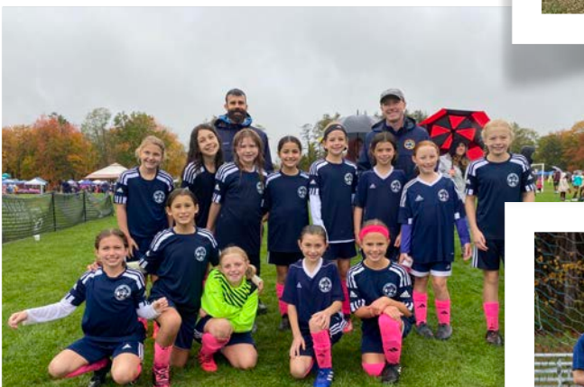
U10 Girls Team makes the most of a rainy South Windsor Fall Classic Tournament.