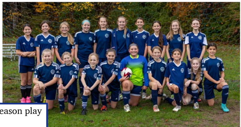
U12 Girls finish regular season play undefeated.