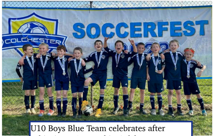
U10 Boys Blue Team celebrates after achieving 4-0 record in Colchester

Crowned co-winners of the league, the Rovers U9 Boys Red Team went undefeated in league games and ended the season with an overall record of 9-1-1. The U10 Boys Blue Team won all their games across two tournaments, conquering eight teams combined in the South Windsor Fall Classic in October and the Colchester Soccerfest Tournament in November. Topping the league with seven victories, the U10 Girls Team finished the season with no losses in league play. The U12 Girls Team made it to the finals at the Ocean Cup in Cape Cod Columbus Day weekend, winning the semifinal game in penalty kicks. Later in the year, they went on to capture the championship at the Colchester Soccerfest Tournament. They capped off the regular season with an undefeated record of 9-0-2.