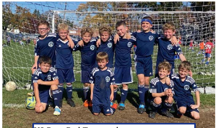
U9 Boys Red Team ends season as co-winners of the league.